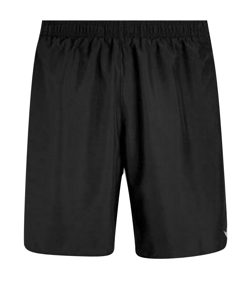
Plain black shorts No Unity logo and no other branding or logo From £3.99