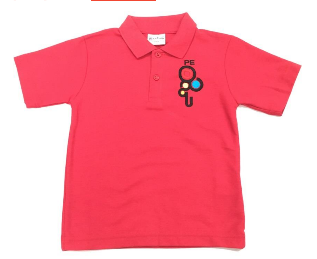
Unisex polo shirt Unity logo clearly displayed on left chest or plain red. (No other logo or branding)

All pupils must have a minimum of these 2 items.